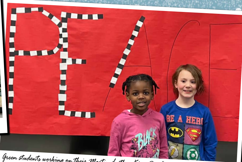
Green students working on their Martin Luther King Day "peace" banner in January