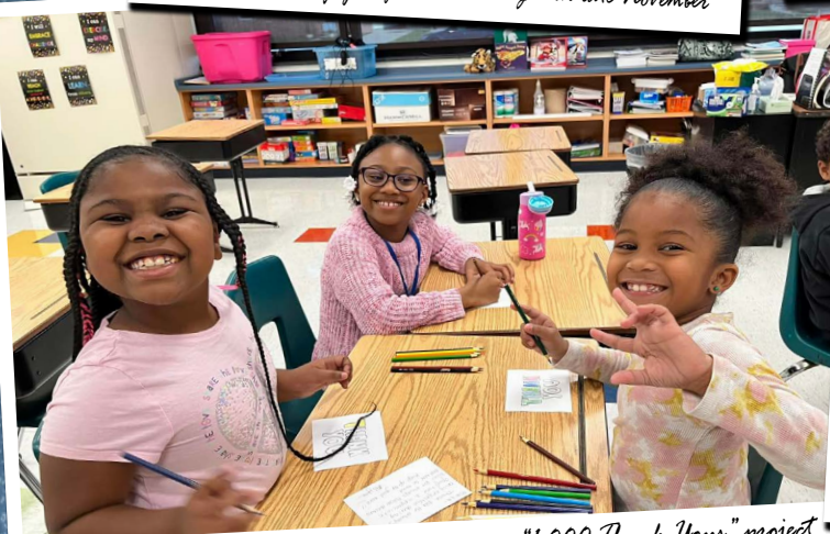
Kaiser students hard at work on their ongoing "1,000 Thank You's" project