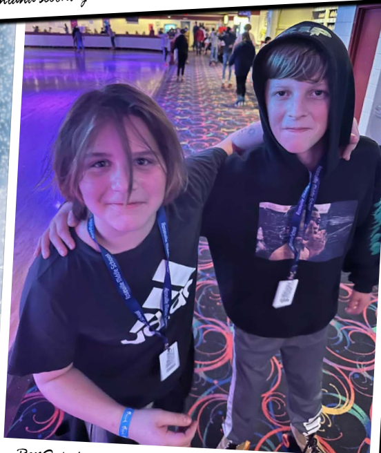
RMS students enjoyed Great Skate night in late November