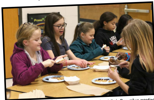
Fountain students creating healthy snowman snacks at their December meeting

The Building Healthy Communities program is a collaborative partnership between Blue Cross Blue Shield of Michigan, the Michigan Health Endowment Fund, the Michigan Fitness Foundation, the United Dairy Industry of Michigan, and Wayne State University's Center for Health and Community Impact.