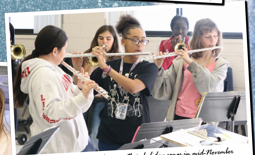
RMS band students working on their holiday songs in mid-November