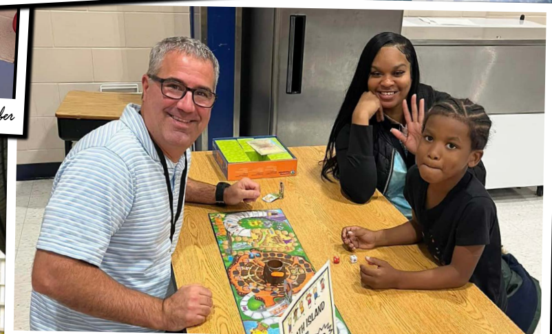
Students and staff had a blast at Dort's Family Game Night in early November