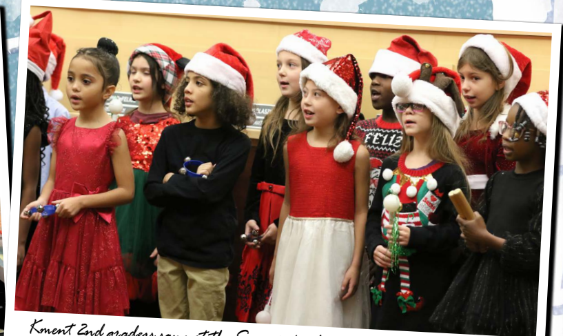
Kment 2nd graders sang at the Superintendent's Discussion Group meeting