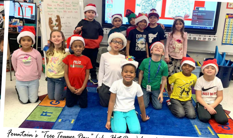
Fountain's "Tree Topper Day" (aka Hat Day) brought festive fun in December!