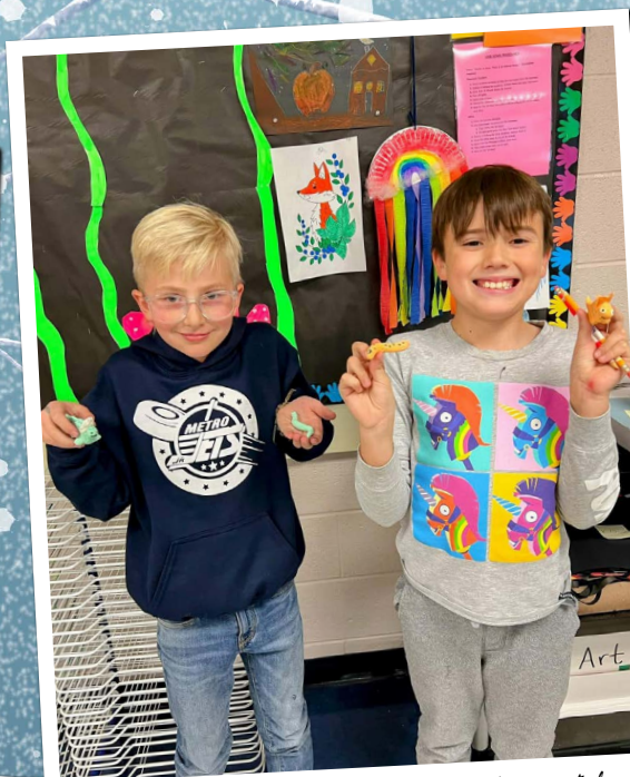
Patton students having fun molding air dry clay in art class