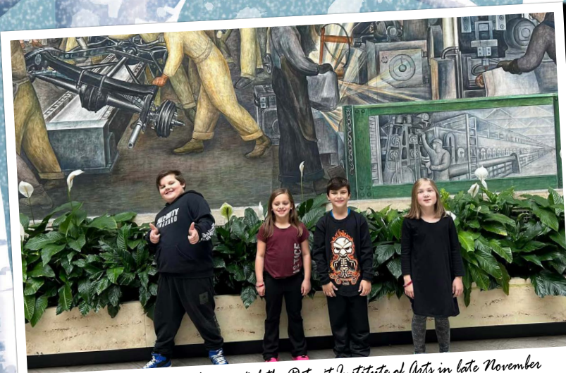
Steenland second graders visited the Detroit Institute of Arts in late November