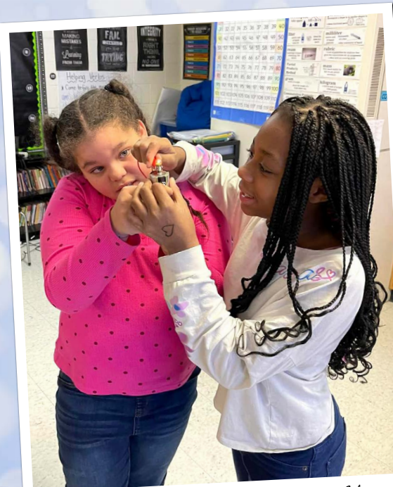
Green students learned about building circuits in February.