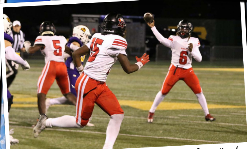
RHS battled De La Salle in the Regional Championship at Wayne State in November.