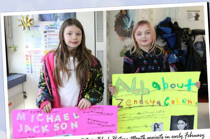
Fountain students showing off their Black History Month projects in early February.