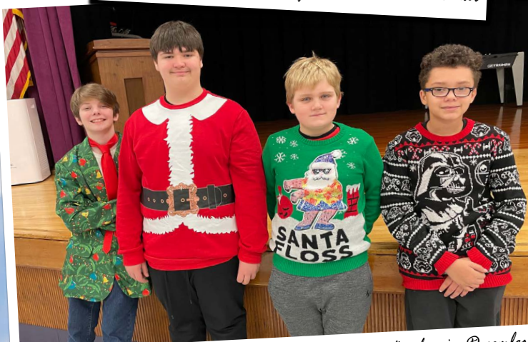
EMS students got in the holiday spirit for ugly sweater day in December.