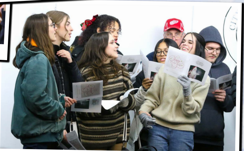
The RHS choir helped welcome Santa at the annual City of Roseville Tree Lighting.