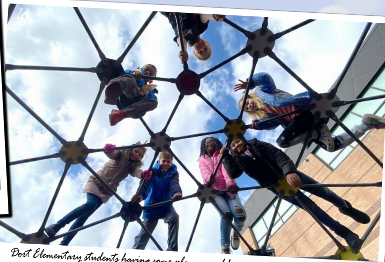
Doit Elementary students having some playground fun on a warm day in November.