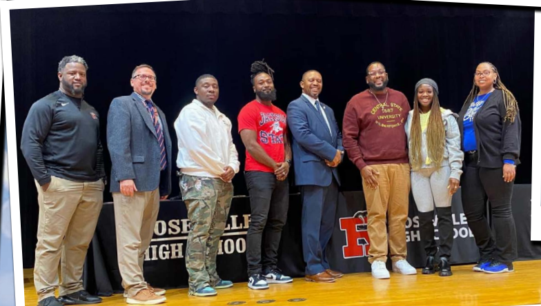
Roseville High School held their first ever HBCU College Fair in November.