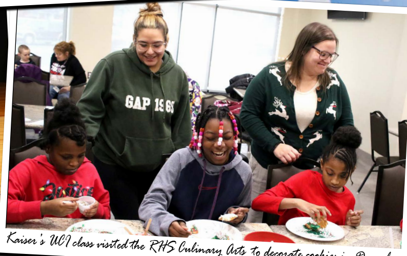
Kaiser's UCI class visited the RHS Culinary Arts to decorate cookies in December.