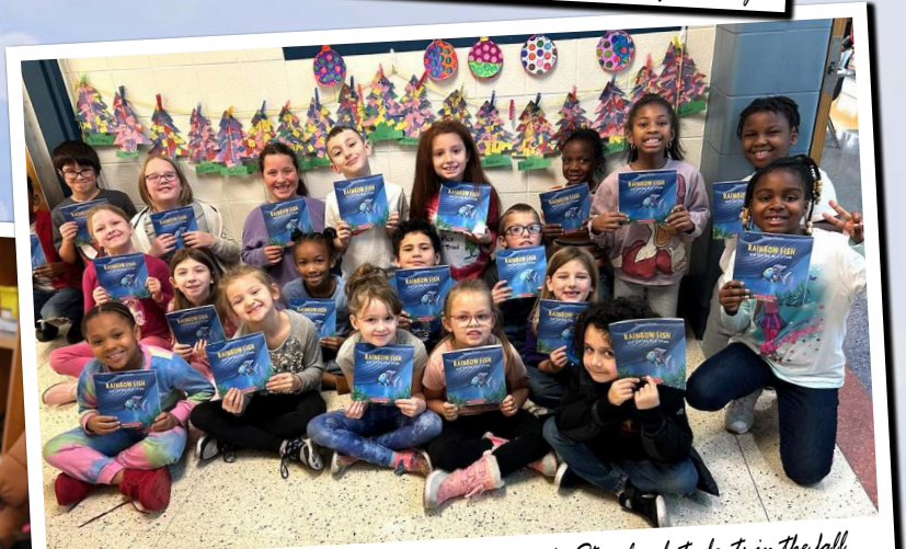
CARE of Southeastern Michigan provided lessons to Steenland students in the fall.