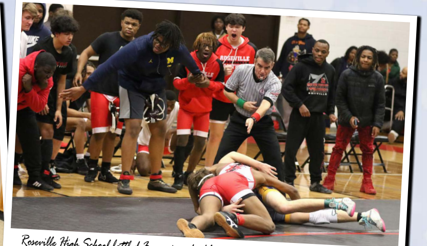
Roseville High School battled Fraser in a highly contested wrestling meet in early February.