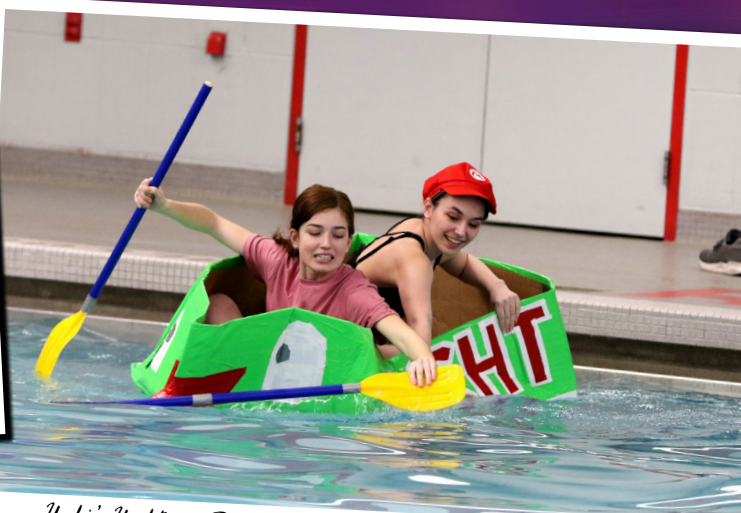
Yoshi's Yacht won Roseville High School's Cardboard Regatta in mid-May